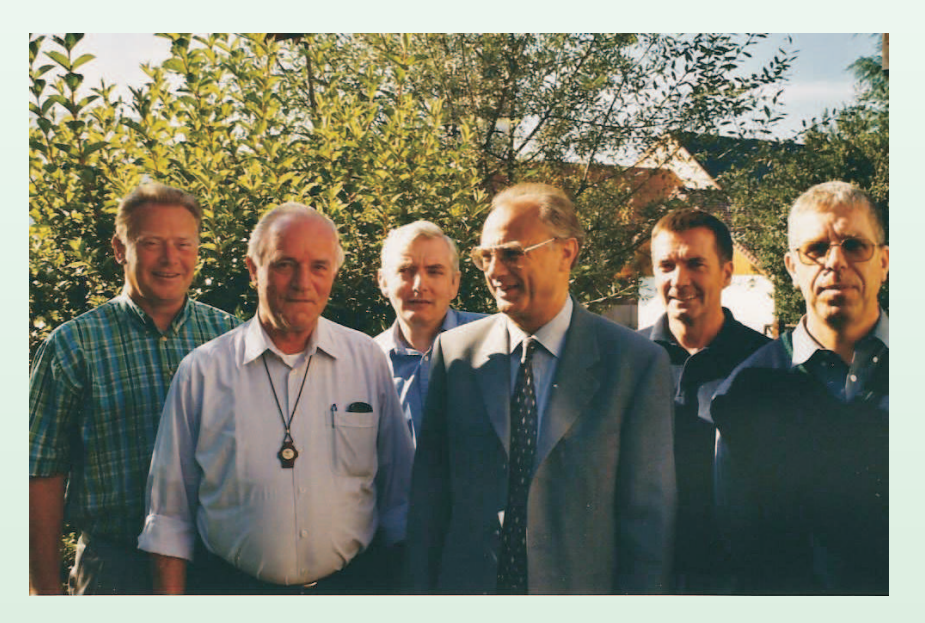
April 2000 1st Provincial Council