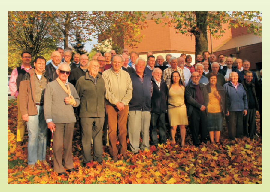
October 2013 Province Workshop