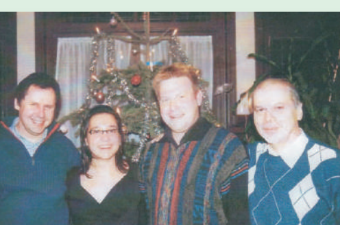
July 2007 Partnership Commission