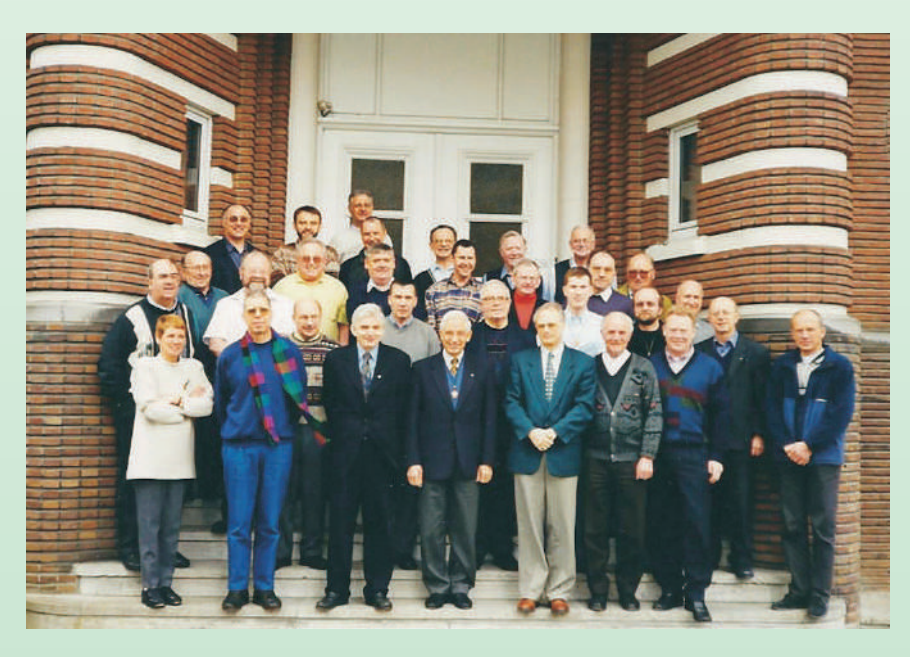
April 2000 Provincial Chapter