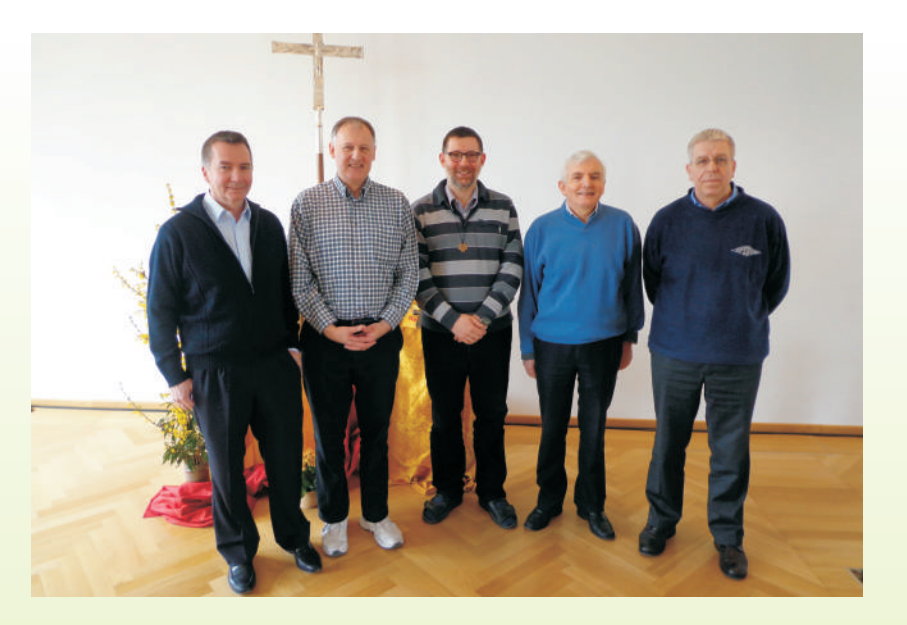
April 2013 Provincial Council