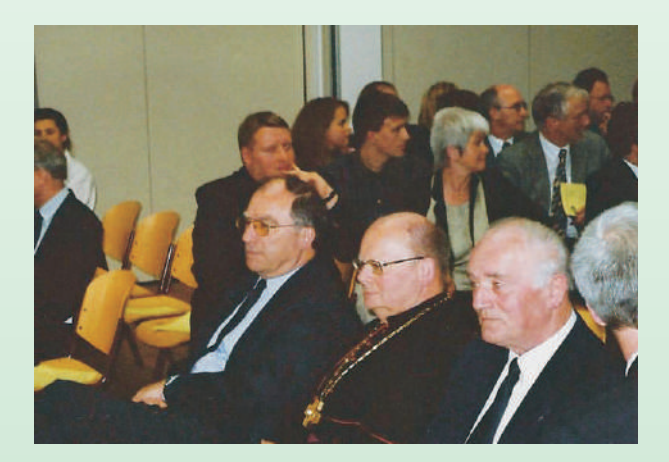
June2004 Handing over of the Marist school in Recklinghausen